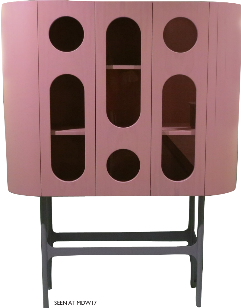
SEEN AT MDW17