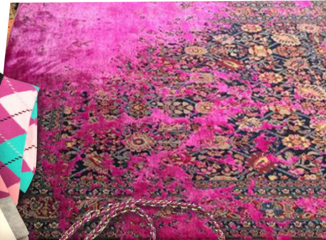
SEEN AT ICF