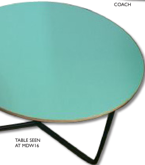
TABLE SEEN AT MDW16