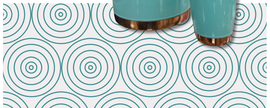
ROLLER SHADE PATTERN BY MARIGOLD DESIGN