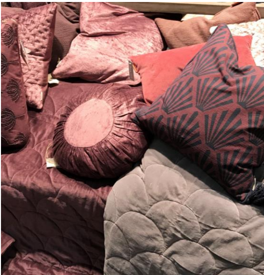
Pink-influenced reds from Cinnamon to Terracotta dominated the show with their sophistication and natural tone. It works with both cool and warm pairings such as cream and grey.