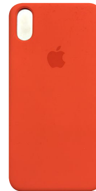
Seen at Apple