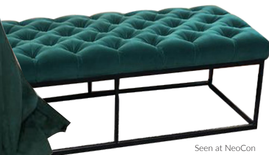
Seen at NeoCon