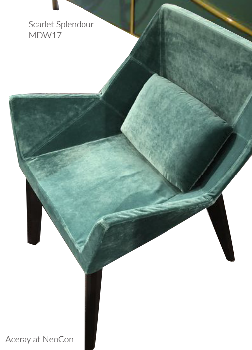
Aceray at NeoCon