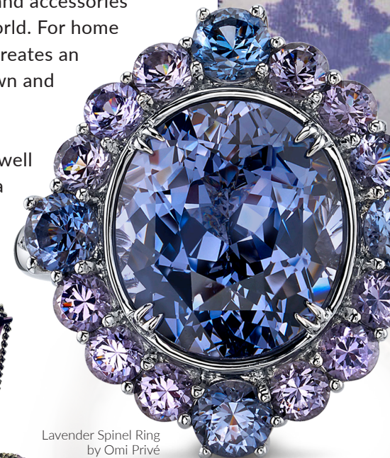
Lavender Spinel Ring by Omi Privé