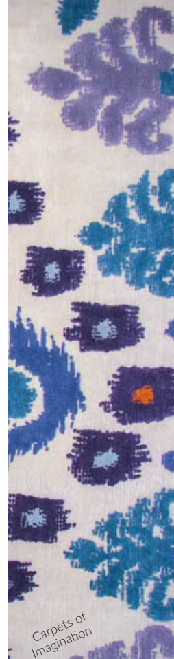
Carpets of Imagination