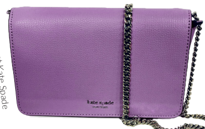
Seen at Kate Spade